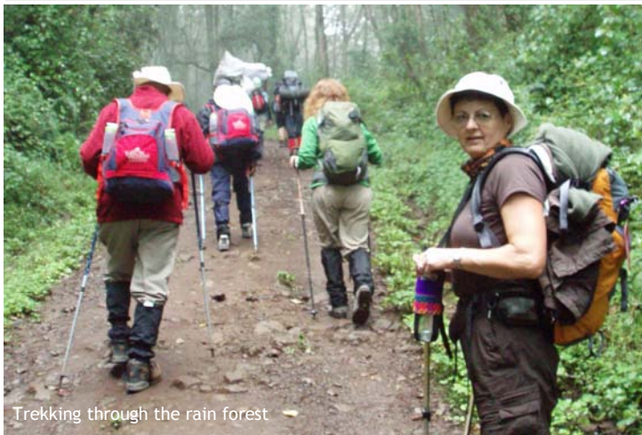
Trekking through the rain forest