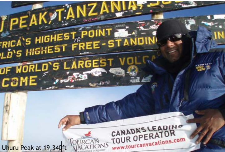
Uhuru Peak at 19,340ft