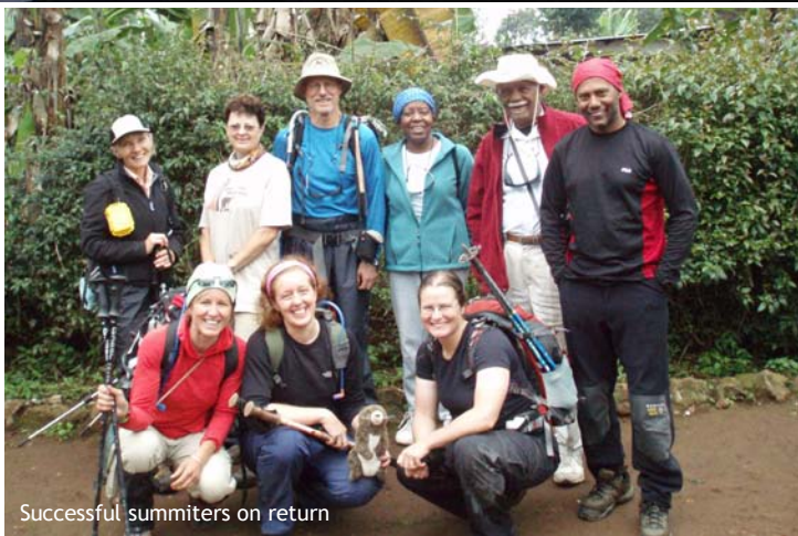
Successful summitters on return