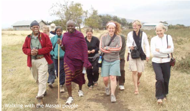
Walking with the Masaai people

Not Included: Taxes on air (Currently at $400, subject to change), mandatory medical/emergency/cancellation insurance; meals other than specified; your personal trekking kit & clothing including the sleeping bag, trekking poles; Tanzania visa fees ($60 approx); Personal expenses, hotel beverages, tips for mountain guides, porters, safari drivers, cooks and hotel staff.