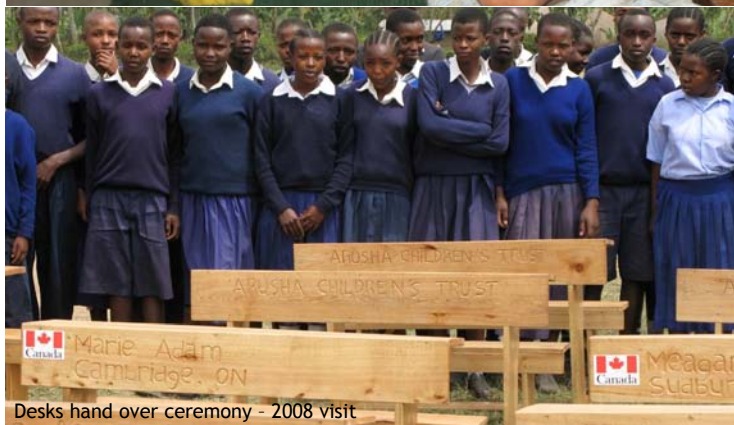
Desks hand over ceremony - 2008 visit