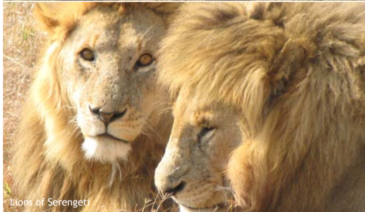
Lions of Serengeti