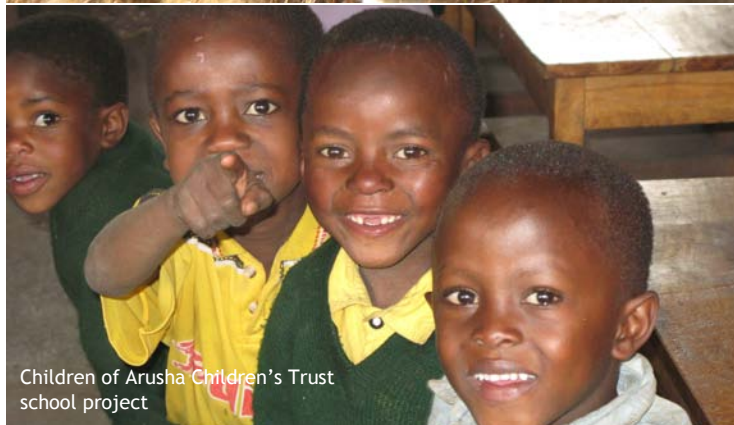
Children of Arusha Children's Trust school project